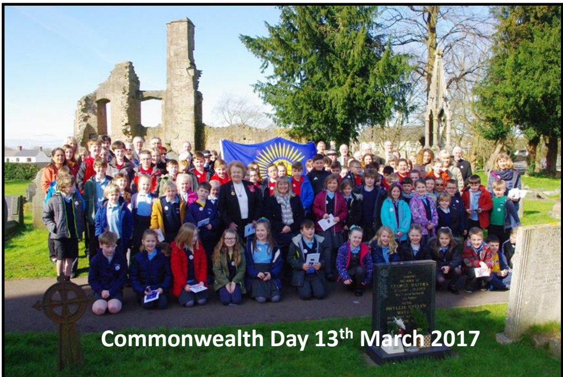
Commonwealth Day 13 th March 2017